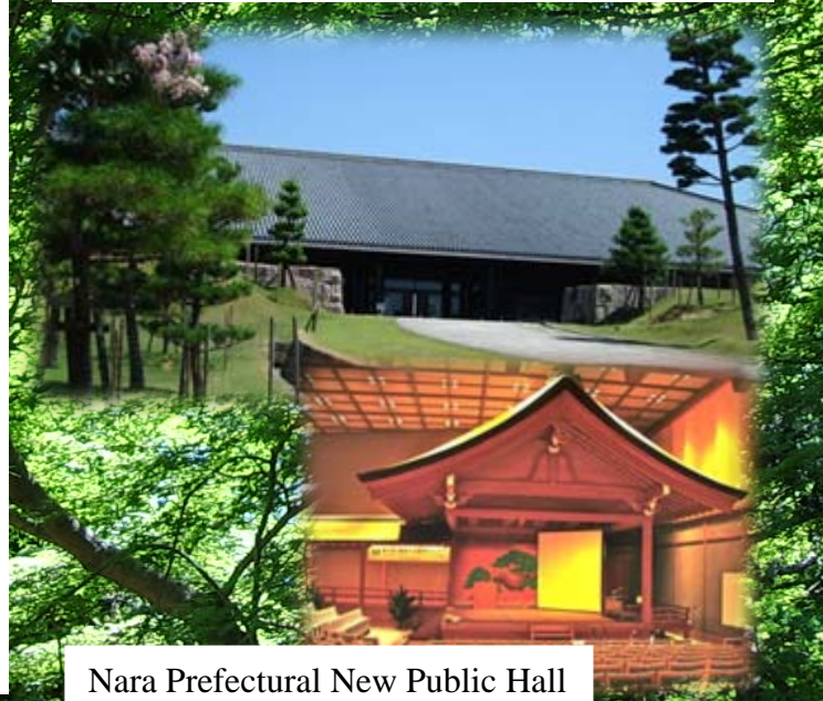
Nara Prefectural New Public Hall